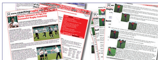
SEE TECHNICAL JOURNALS & EXPERT OPINIONS