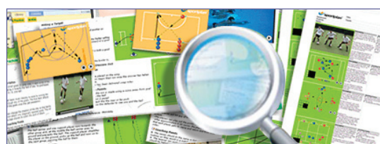
SEARCH 1000s OF ANIMATED EXERCISES