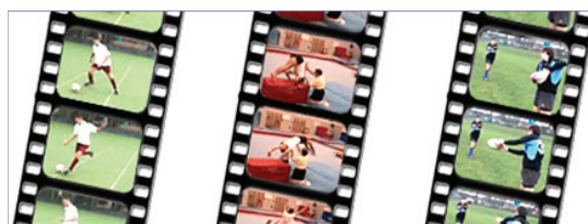
ANALYSE VIDEO CLIPS